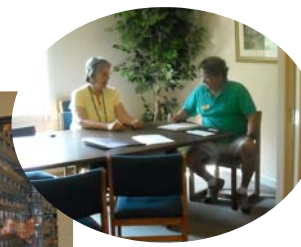
AGENCY SITE REVIEWS INITIATED