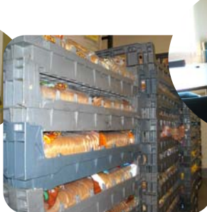
ADDITIONAL DISTRIBUTIONS OF BREAD AND PERISHABLES