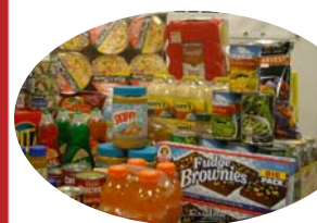
INCREASED DONATIONS OF FOOD